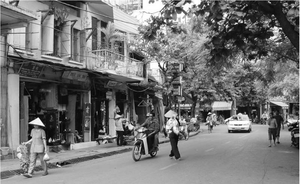
Figure 2. A typical trading street in the Ancient Quarter